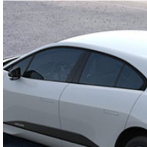
WINDOW SUR- ROUNDS