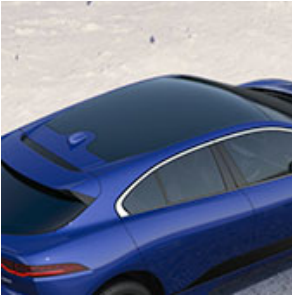
ROOF COL- OR