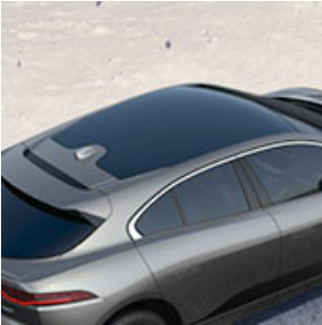
ROOF COL- OR