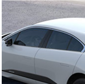
WINDOW SUR- ROUNDS